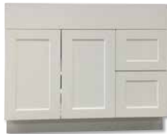
36" WHITE VANITY