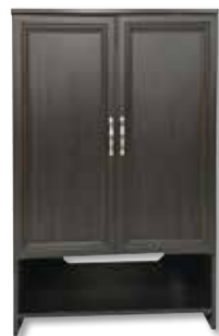
25" ESPRESSO CABINET W/ 2 DOORS