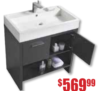
RELAX GREY VANITY